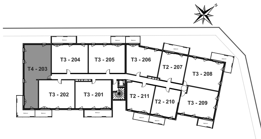
Plan de repérage